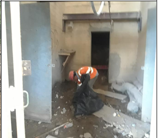
Picture showing cleaning at Roselyn abutment