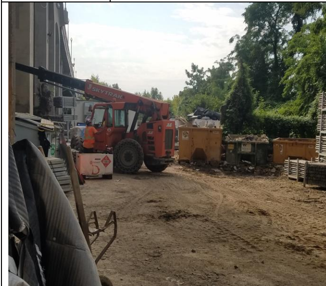
Technopref arranging scaffolding stockpiles & plywood in the staging area for demobilizing