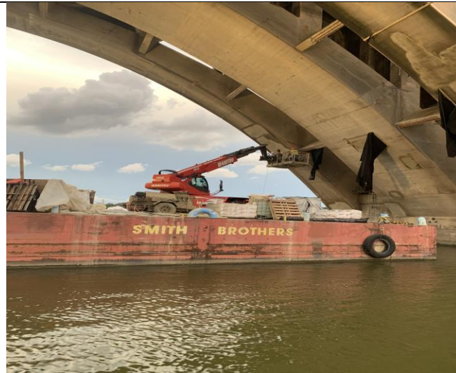
Technopref building containment for demolished marked de-laminated concrete at Span H