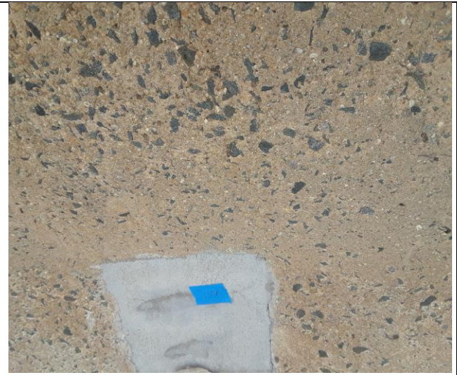
Picture showing mark deficiency grout pocket on the PCC Barrier