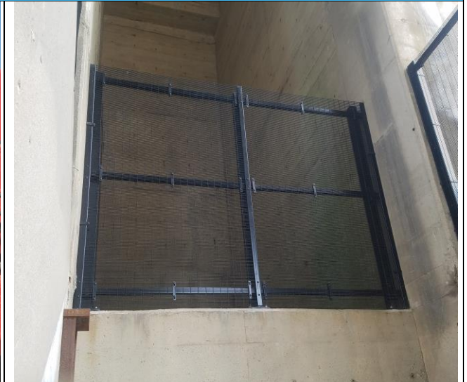
New Security Fence at Rosslyn Abut Bay 2, N Elevation