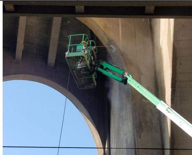
Technopref at East Ramp Bent 16 to 12 continued power washing to clean shotcrete residue on patches