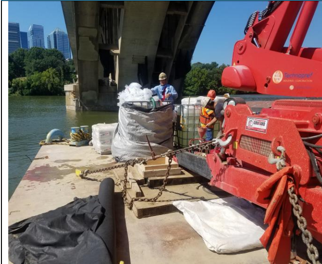
Technopref placing ice into water tank for shotcrete mixing to reduce conc temperature