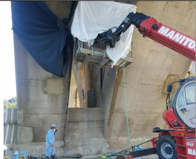
Ward & Assoc wet shotcrete contained patch at Span E Bay 2 Diaphragm close to Pier 3