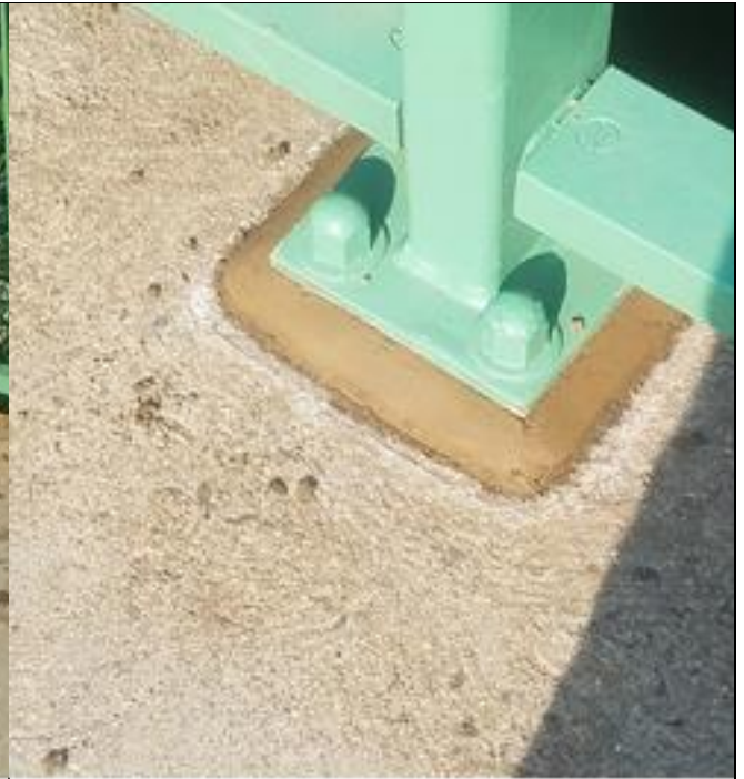
Working on deficiency list for pedestrian railing and placing grout for the railing base along the Key Bridge.