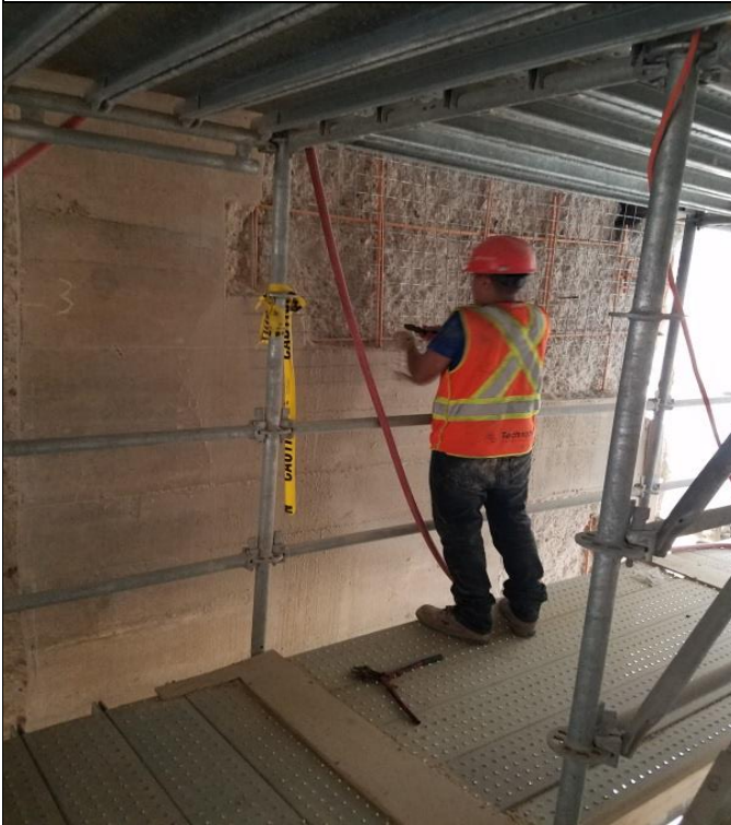
Wire mesh installation observed at Level 3, Pier 1, Row E, West Face