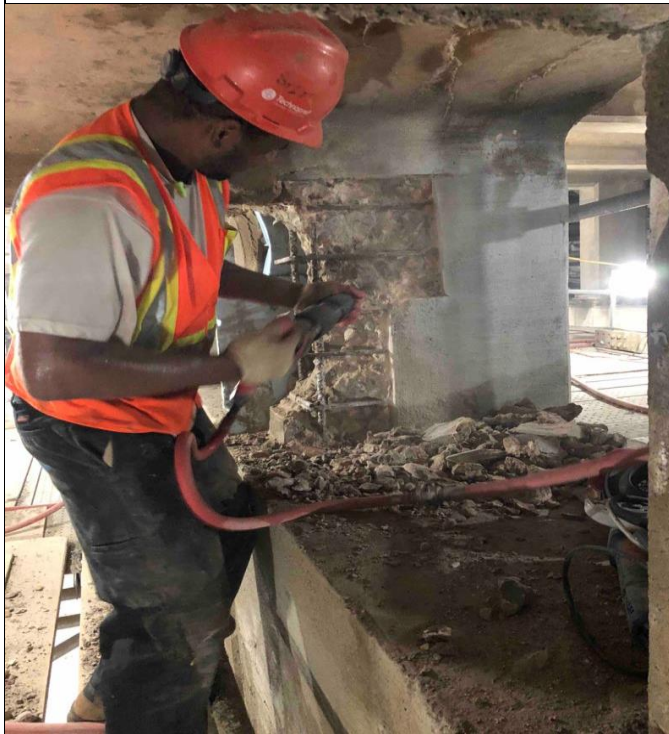
Concrete demolition of span F DP D49 p2