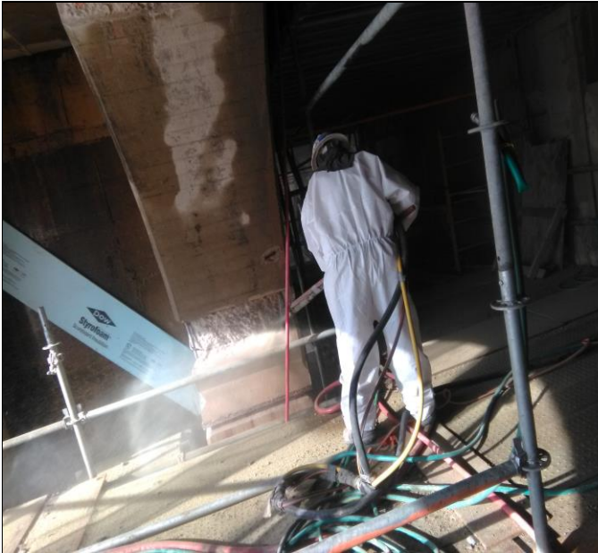
Blasting rebar at Spandrel column 5/6 row E by Pier 1