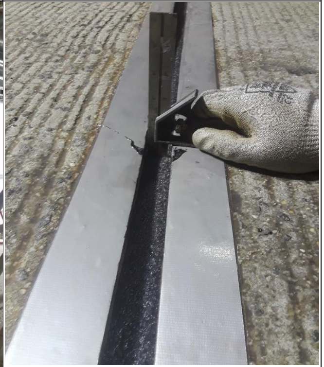
Repair work for Non-armored joints