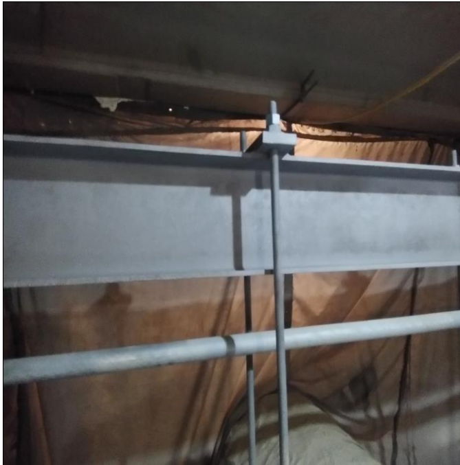
Water Main steel supporting beam after sandblasting