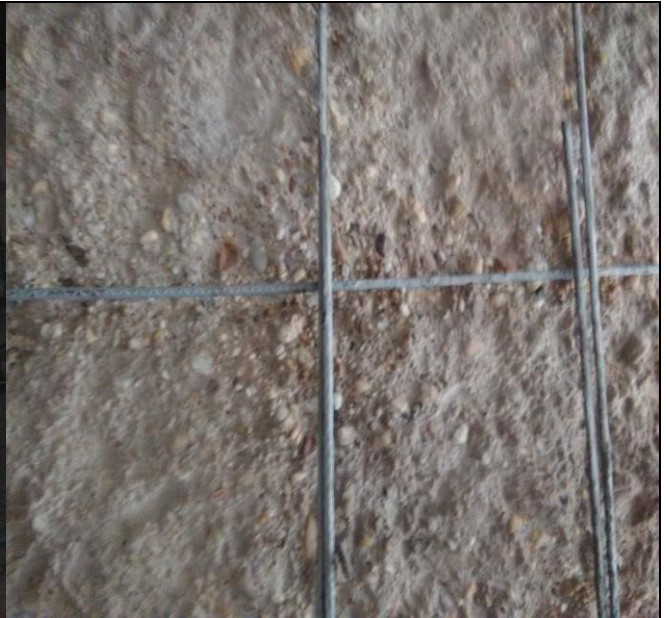
Blasted rebar at row E level 1-3 Pier 1