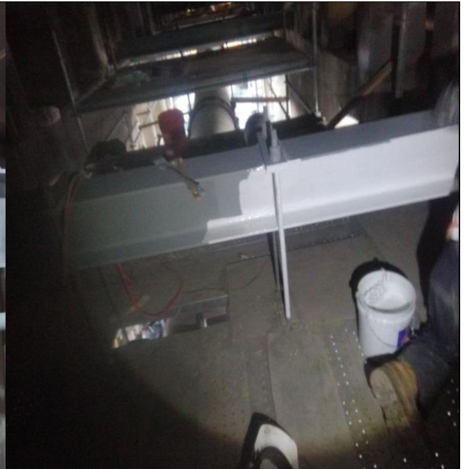
applying intermediate paint for Water Main support beams in span E