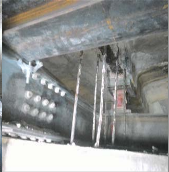
Setup for Repair/Replacement pedestal at row D column 52