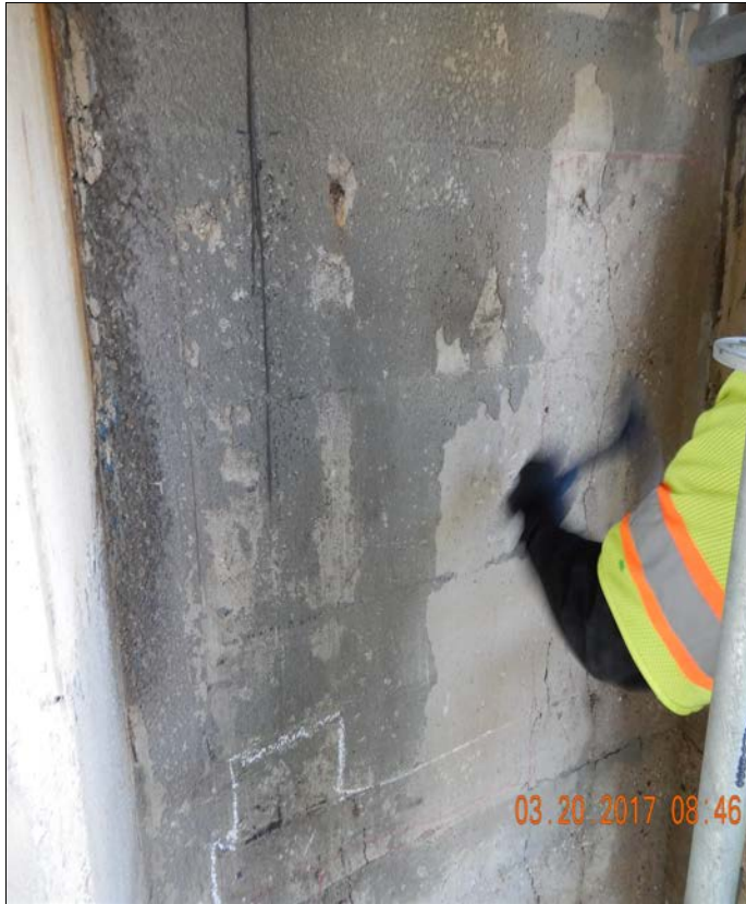
Concrete sounding at pier 4