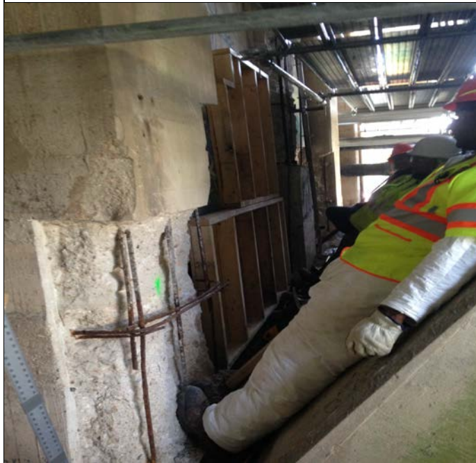
Setting up forms at North abutment