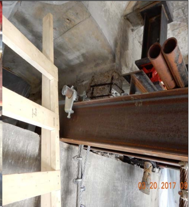
Setup for Repair/Replacement of pedestal at row D column 52.