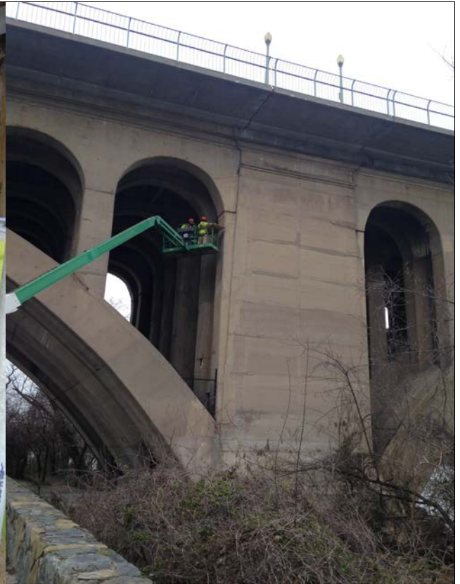
Removing delaminated concrete at the south span-drel column of south abutment