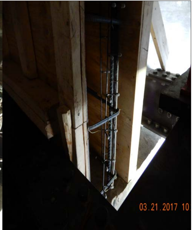
Setup for Repair/Replacement pedestal at row D column 52