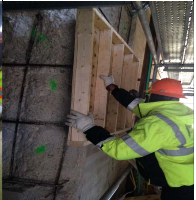
Setting up forms at North abutment