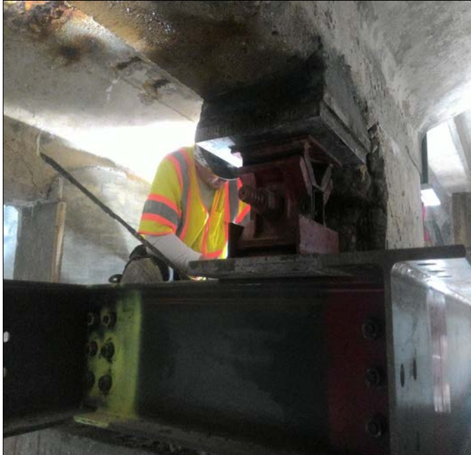
Setup for Repair/Replacement pedestal at row D column 52