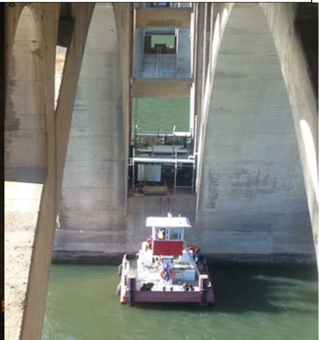
Installation of scaffolding system at pier 3