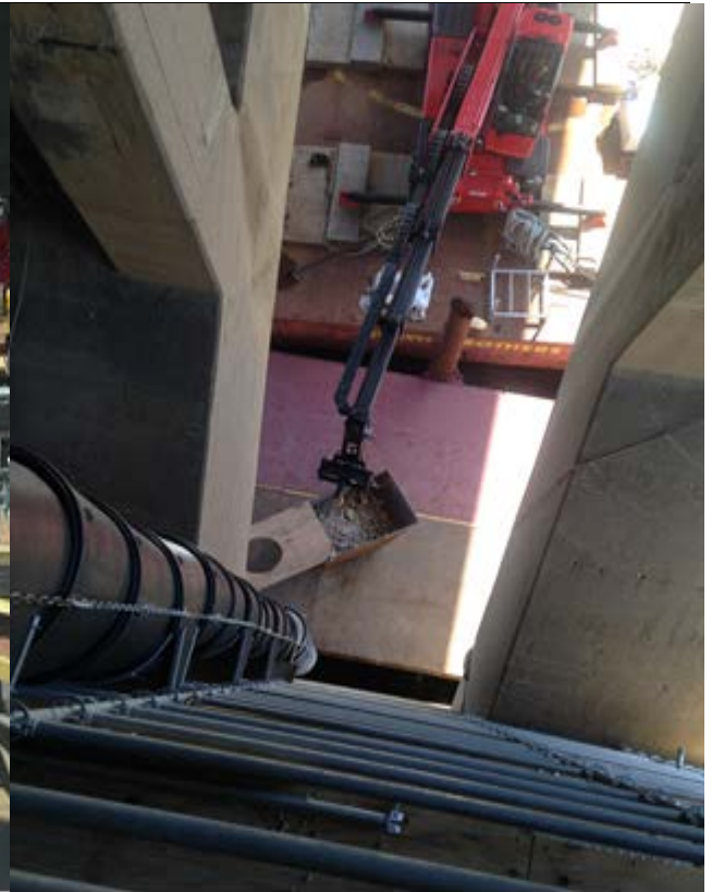
Cleaning and switching concrete skips