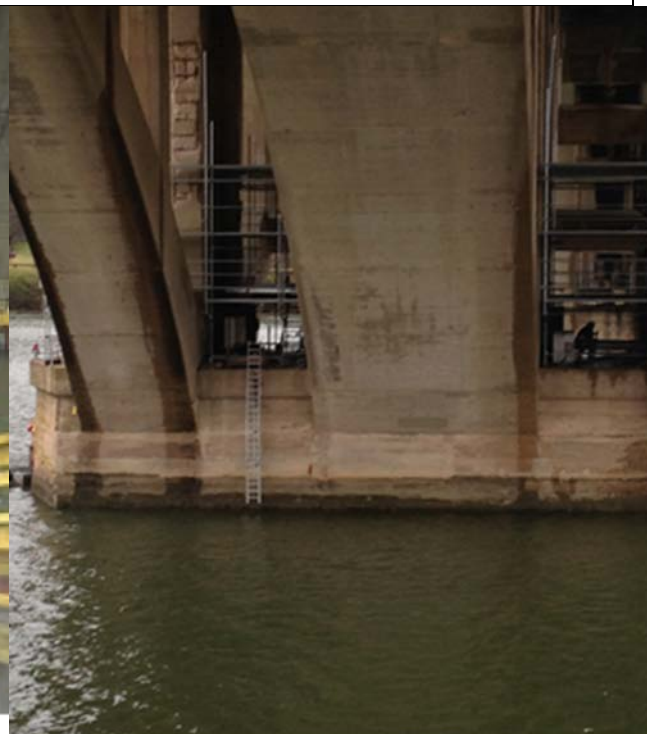
Installing scaffold at pier 3