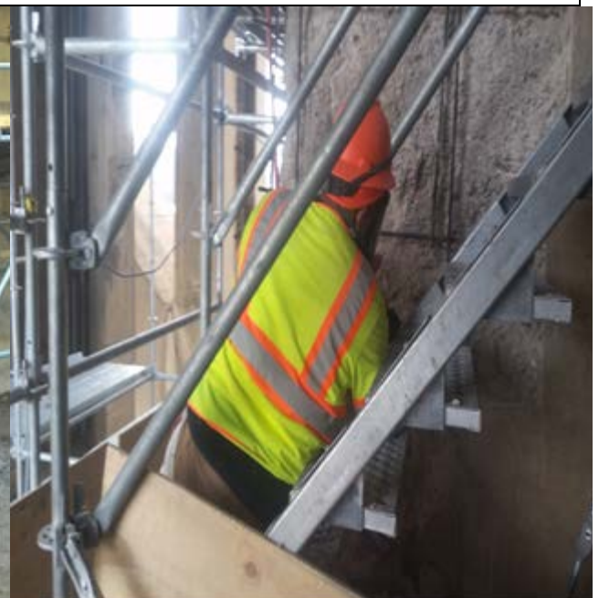
Concrete demolishing and saw-cutting at pier 4