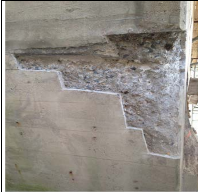
Mock ups location for dry mix shotcrete