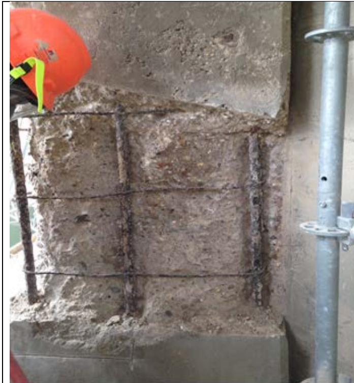
Concrete demolishing and saw-cutting at North abutment