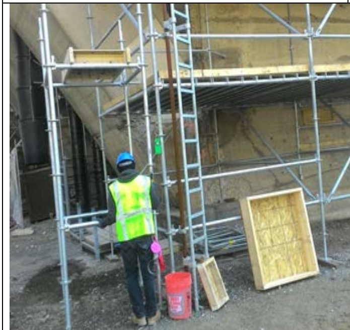
Mock up panels preparation