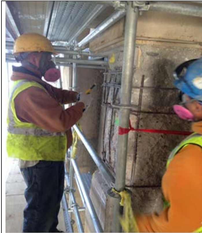
NCR 001 repair preparation