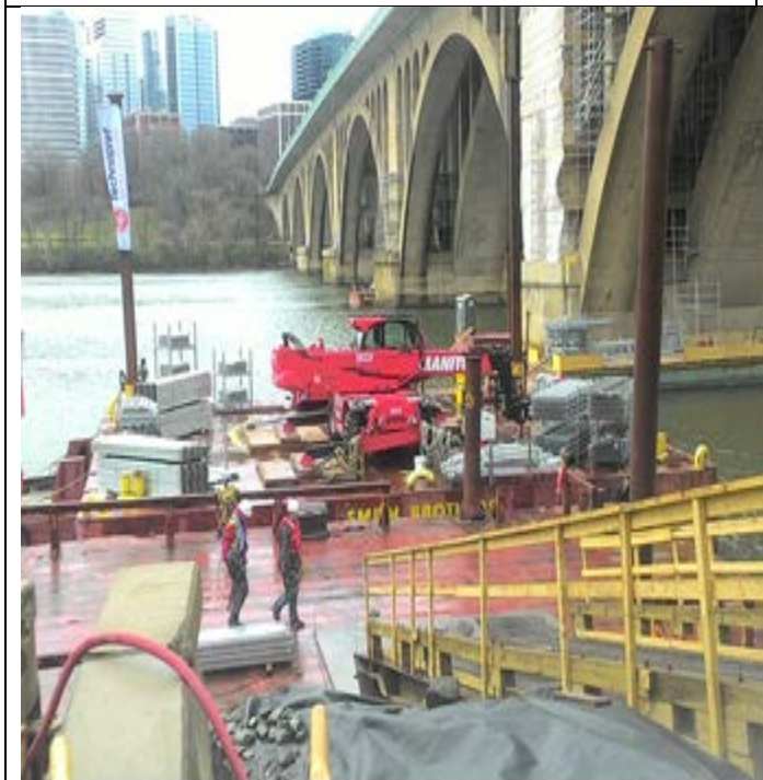
Loading scaffold material to barges