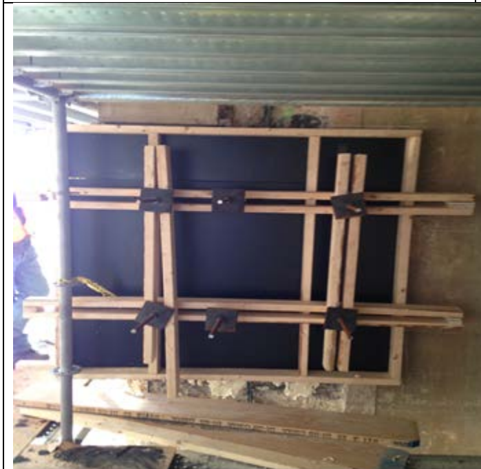
NCR 001 repair preparation (form work)