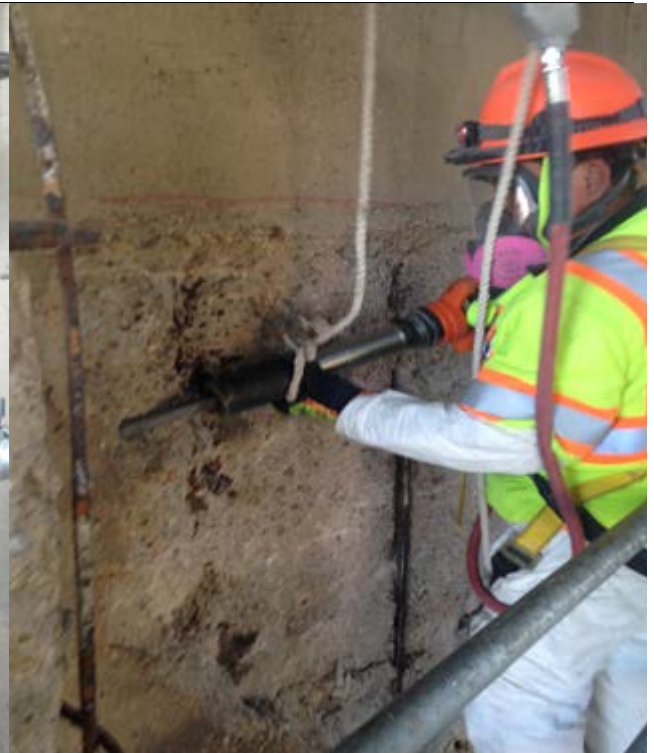
Concrete demolishing and saw-cutting at pier 3