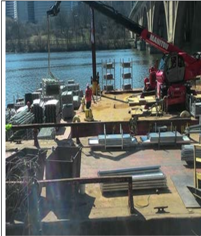
Loading scaffold material