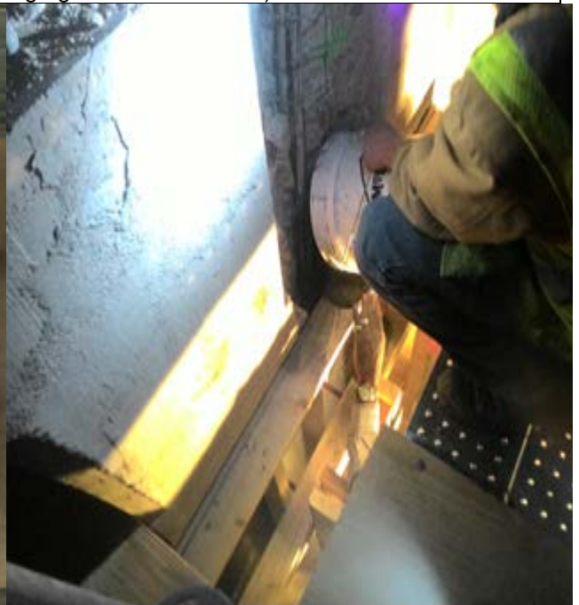
NCR 001 repair (pouring concrete)