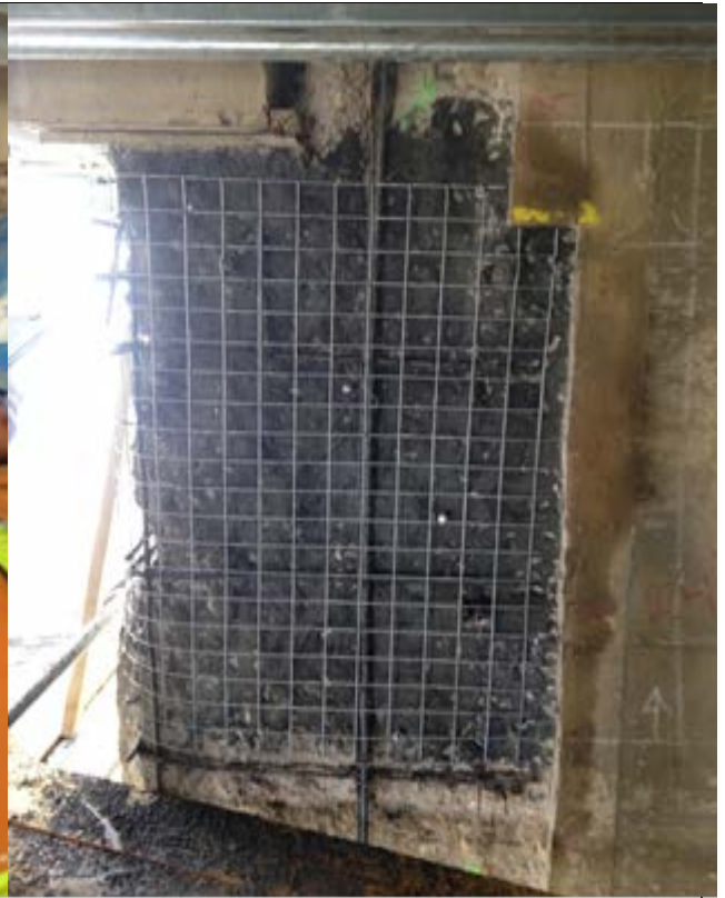
NCR 001 repair preparation (installing rebar, bonding agent and wire mesh)