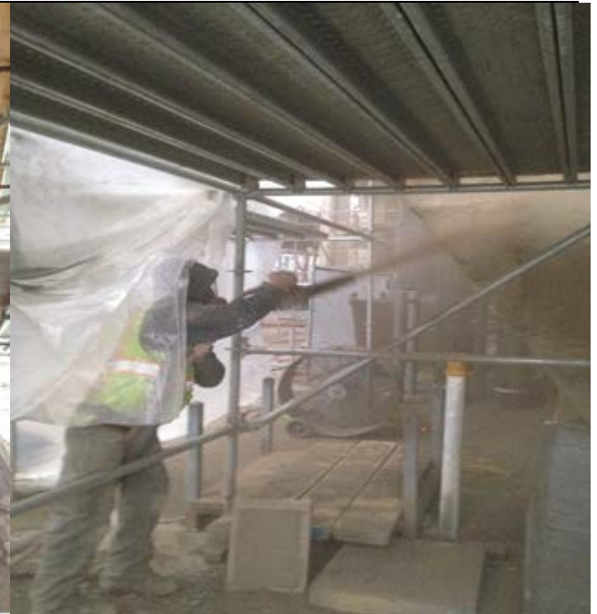
Dry mix shotcrete application