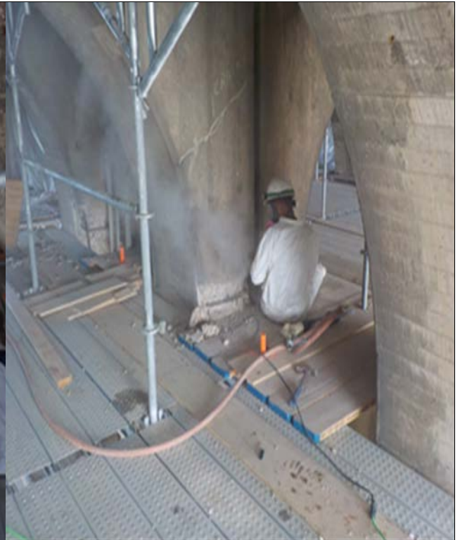
Chipping concrete at Span D