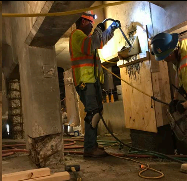
Vibrating concrete in the deck pedestal formwork