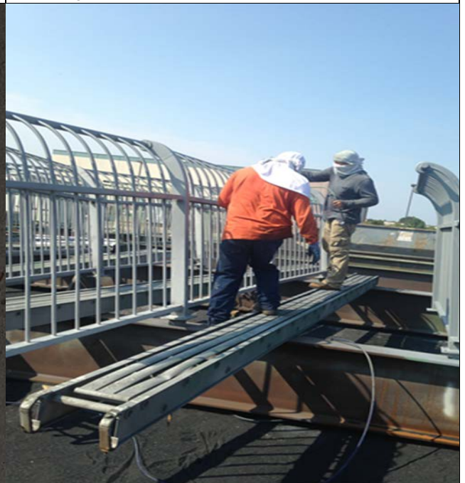
Primer application using spraying method at the plant