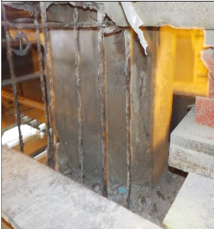
Demolded existing deck pedestal for replacement at Span C