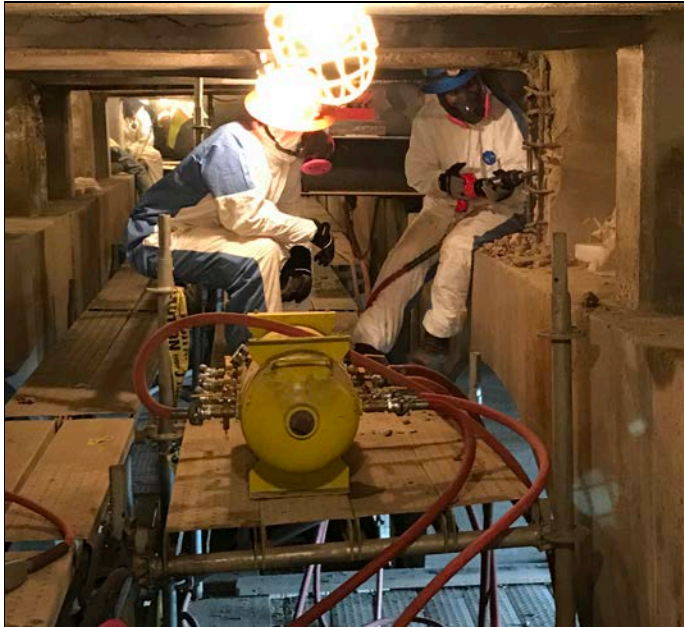
Chipping at deck pedestals at Span C, Row D