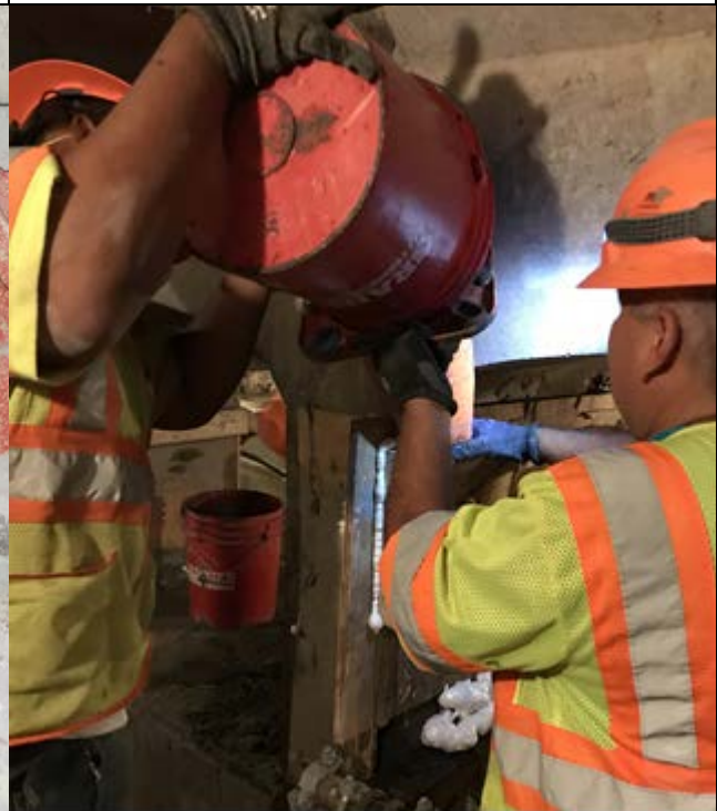
Pouring concrete into Span C deck pedestal formwork