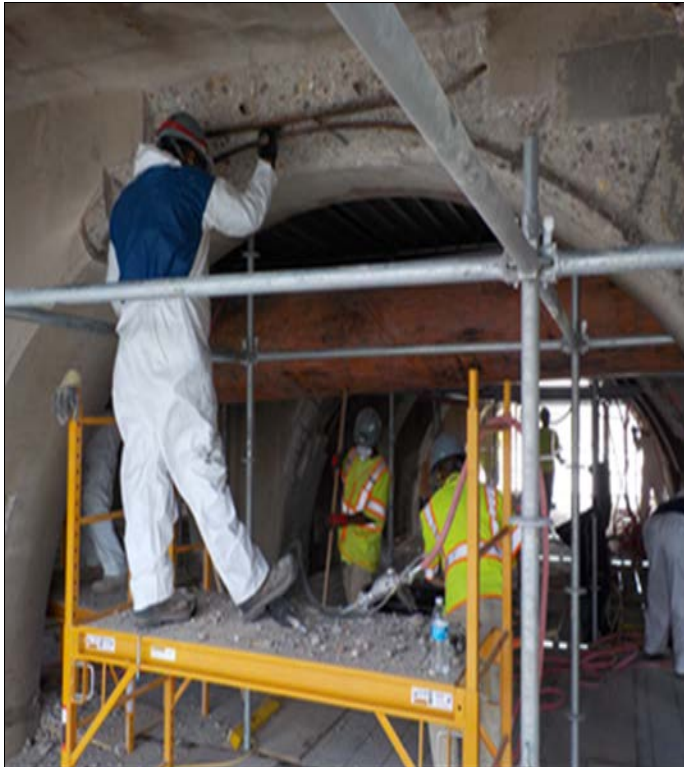
Chipping concrete at Span E