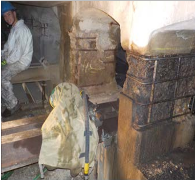
Sandblasting rebar for deck pedestal in Span C