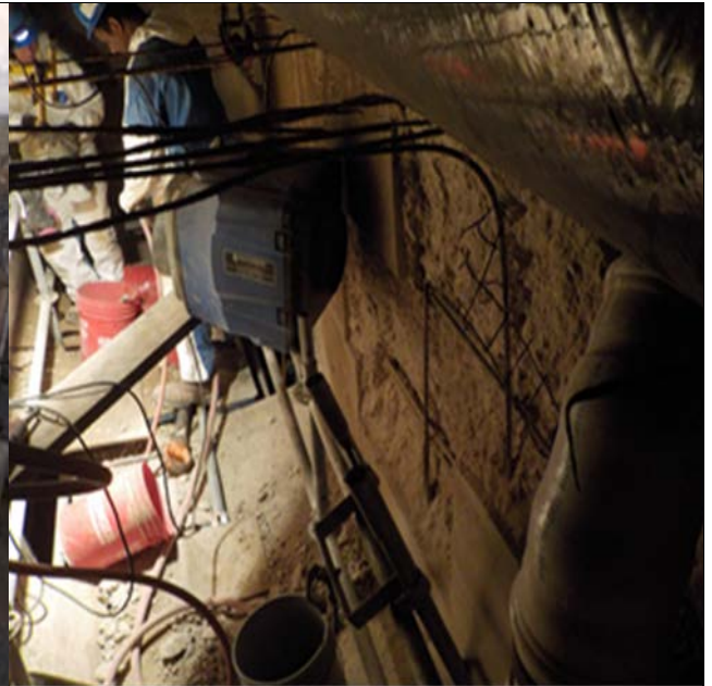
Demolition at East chamber gallery at North Abutment