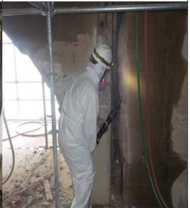
Drilling and installing an anchor for the wire mesh at Pier 4