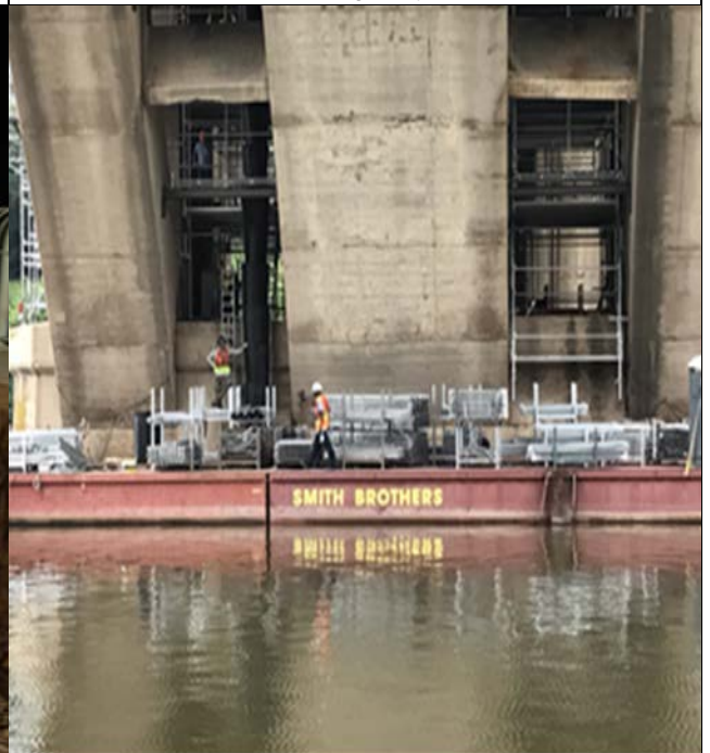
Technopref workers installing scaffolding at Pier 2