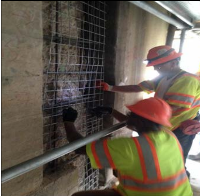
Installation of wire mesh at pier 4