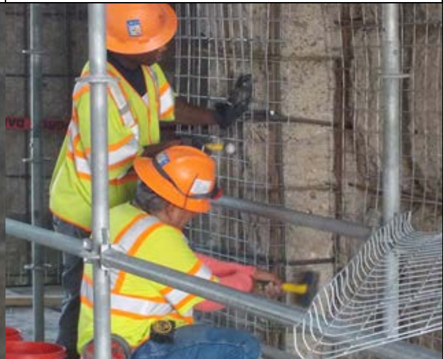
installing rebar & wire mesh on level 6 Pier 4 S Elev in Rows D-B