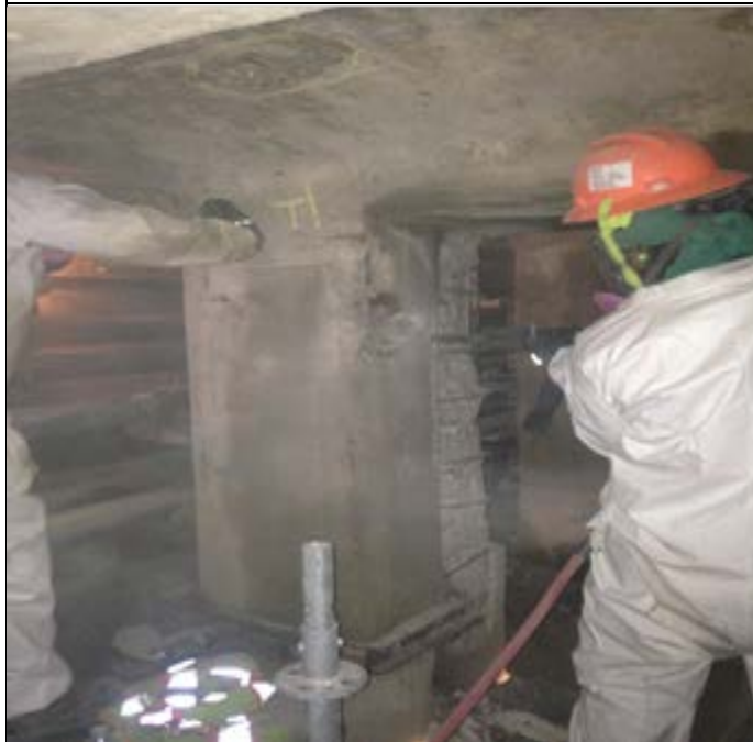
Chipping at pedestal row E span C