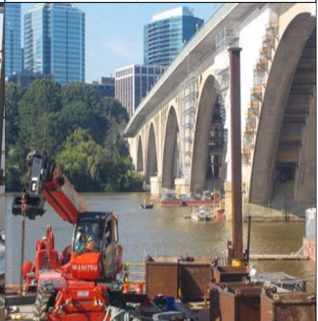
navigating barge with scaffolding materials to Pier 2