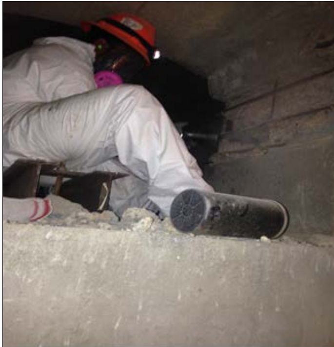
Chipping at floor beam pedestal in span C