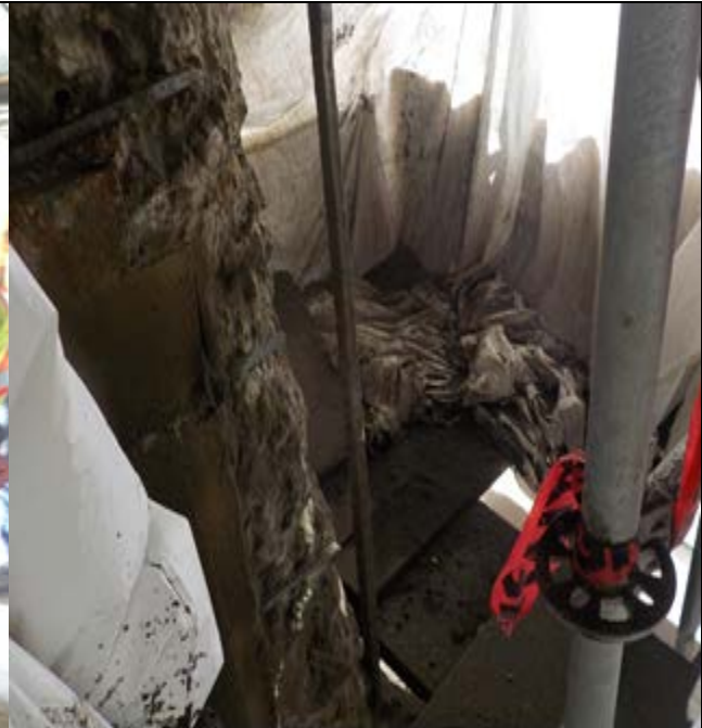
sandblasting within containment on level 3 Span C near Pier 4 in Bay 2, columns 15-16