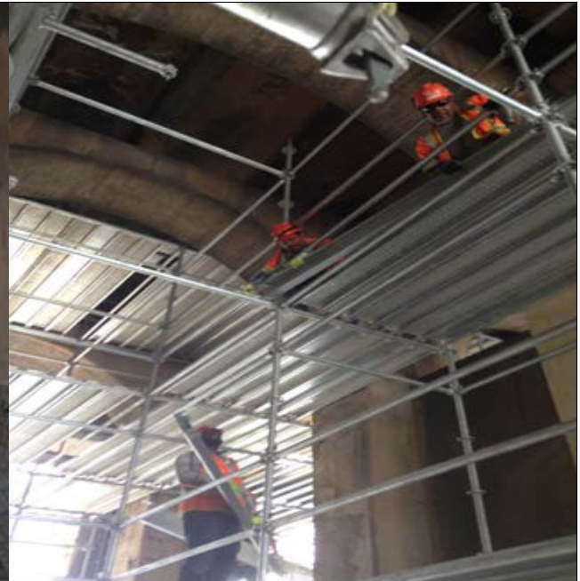
Installation of scaffolding support beam at span E