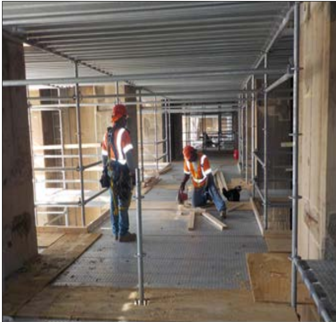
Protection shield placement at span D