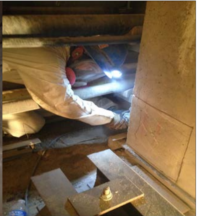
Saw cutting at floor beam pedestal row D in span C