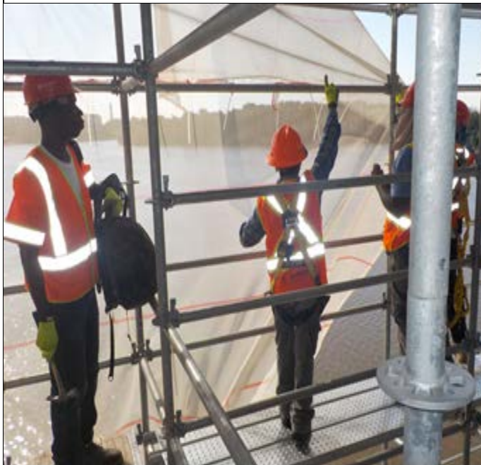
Installation Netting & Protection Shield on Pier 3 to Span E levels 3 & 5 E Elev